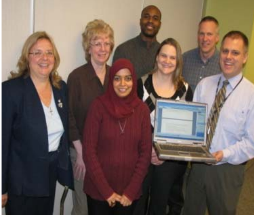
GL/FA Standards Teams

The GL/FA (General Ledger/Fixed Assets) team has been meeting for almost a month. They get together two days a week and will continue to meet up until the end of May.