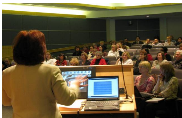
Advanced Clinical Day in Whitby.

Whitby Mental Health Centre will be the first CE LHIN hospital to "go live" with Meditech 6.0 in the fall.